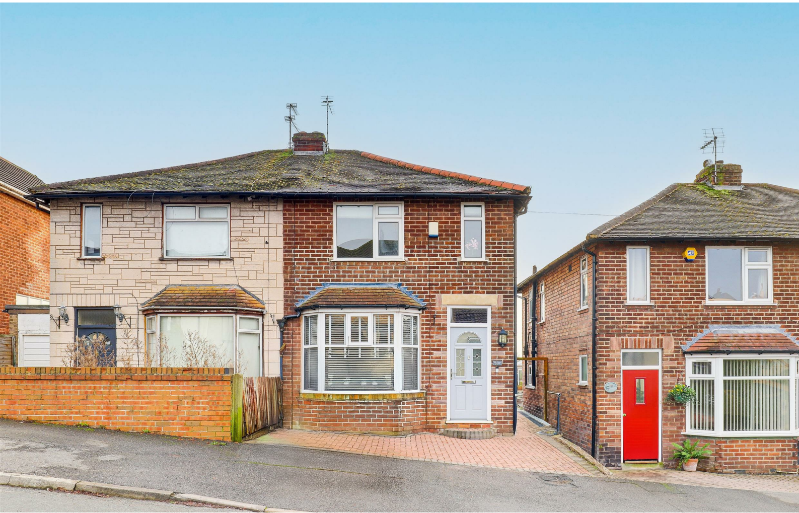
Kenrick Road, Mapperley, Nottinghamshire NG3 6HQ